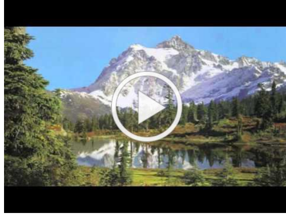
John Wayne 4th of July Tribute