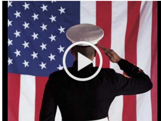
Lee Greenwood - God Bless the USA